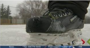
Digging Deeper - Violent youth in Sask. | Watch News Videos Online Watch Digging Deeper - Violent youth in Sask. Video Online, on GlobalNews.ca GLOBALNEWS.ca